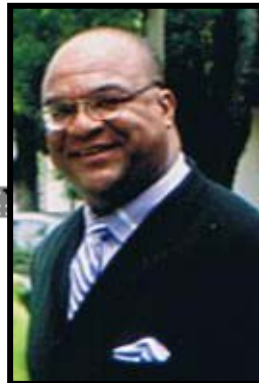
Minister Isaac Ruffin Master of Ceremony